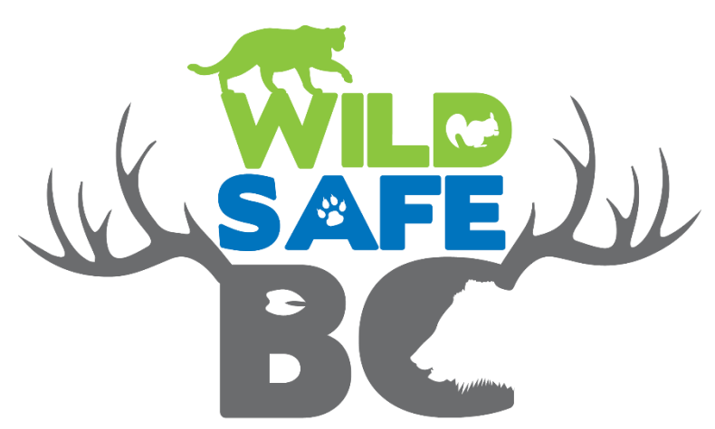
British Columbia Conservation Foundation