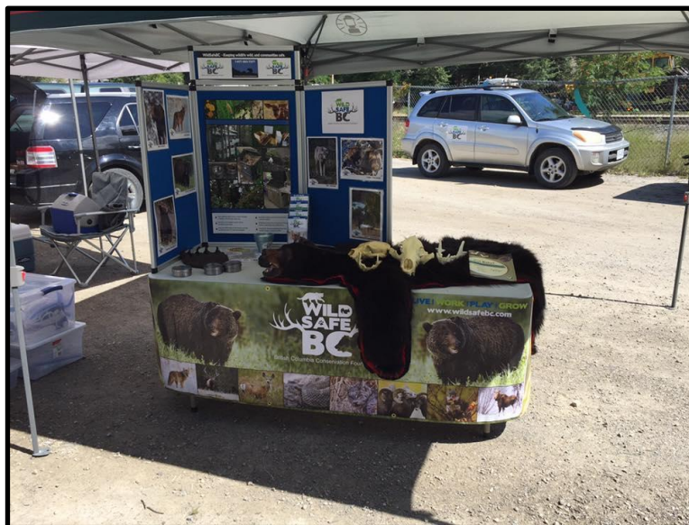
Figure 1. WildSafeBC Golden booth display

Although black bears continue to have the most visible human-wildlife conflict in Golden, many discussions were had regarding skunks, deer, and cougar. The community has rallied together, sharing effective means of conflict reduction, including sharing live traps and relocation methods.