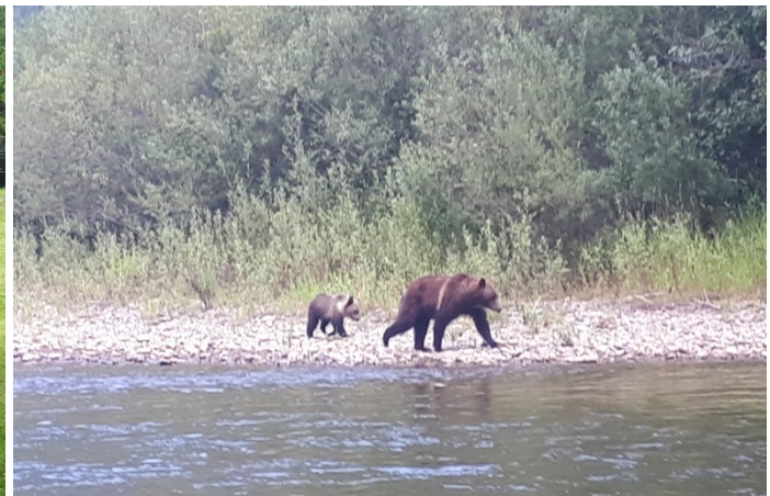
Photo 4: Grizzly sow and cub in their natural environment of the local rivers.