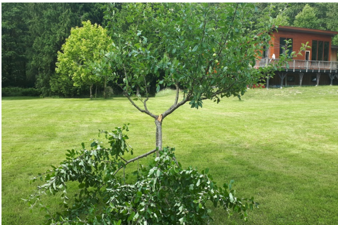
Photo 3: damage done to an unprotected fruit tree prior to electric fence installation.