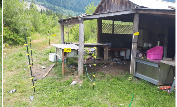
Photo 2: Semi-permanent electric fence around entrance and working area of smoke house (steel stakes and 110v energizer).