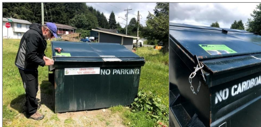
Figure 13. WCC Pacific Rim replacing a broken clasp in Hitacu.

Working with the WCC for the Pacific Rim, it was possible to install and repair over 15 clasps on the community bins of Hitacu and Salmon beach (Figure 13). These clasps are necessary to securely lock the bins to ensure that wildlife cannot have access to the content of the bins and become food-conditioned.