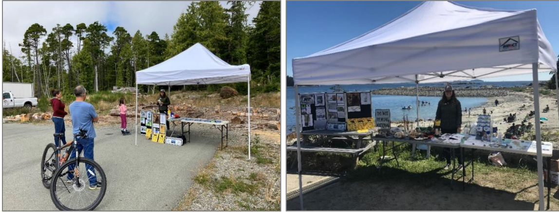
Figure 4. (Left) WCC at the Salmon Beach boat launch and (right) WCC at the Cixʷatin Center in Hitacu.