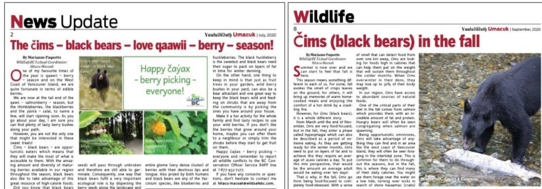
Figure 8. Two of the three articles that the WCC wrote for the Umacuk Newsletter.