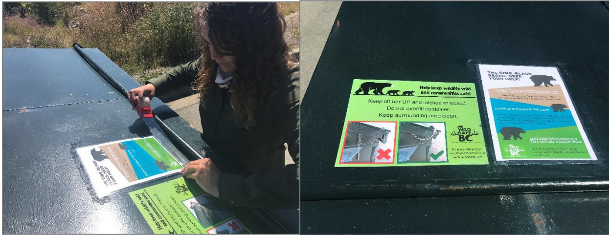
Figure 14. WCC adding new decals to community bins in Hitacu.

As part of the same initiative, new decals were created with the intent to inform residents of the importance of keeping the community bins well latched. The WCC created new artwork (Figure 14) and also put together a short video to promote the same message through social media channels. The video reached over 800 people and generated over 160 interactions on Facebook.