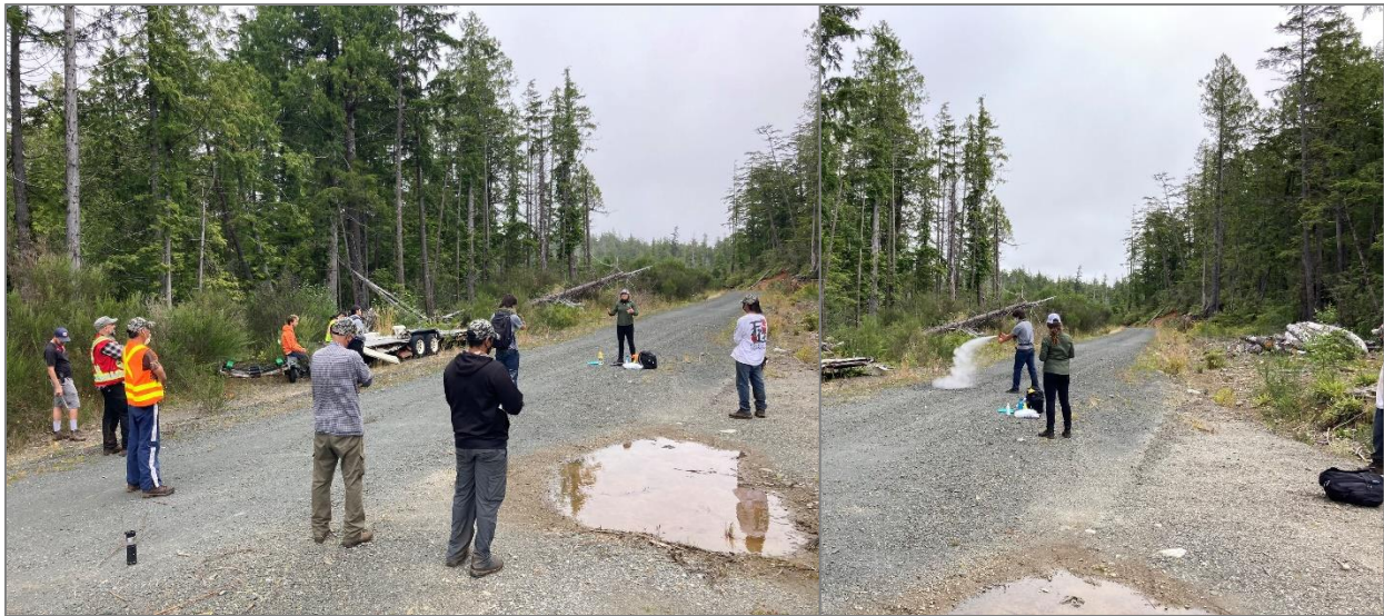
Figure 3. Bear spray demonstration to the youth Warrior program in Hitacu.