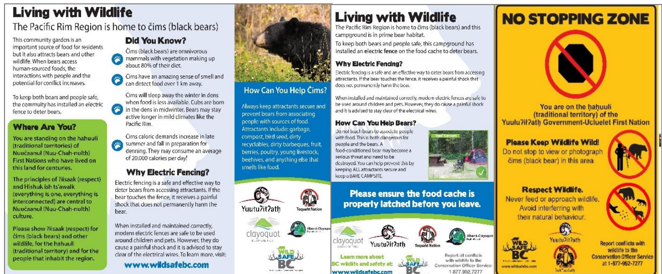
Figure 12. Left to right: signage displayed at the Junction Community Garden, the Wya Campground Food caches and on the side of the road.

The last sign was made to address the issue of people stopping on the road to view and photograph wildlife which has been a recurring problem in the past. This behaviour often leads to human-habituation for the animals, can increase the potential for human injury and can contribute to roadside accidents. With two signs visible from each side of the road, the hope is that the number of people stopping will decrease in the years to come. Signage is only one part of the equation, the WCC is hoping to be able to increase awareness of these topics through more educational campaigns.