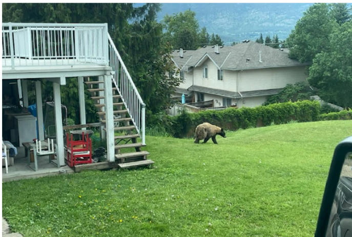
The bears are back in town and WildSafeBC is urging people to take steps to reduce wildlife-human conflicts as there have already been a few sightings in town, including this one seen roaming around 2nd Avenue NE by King's Christian School.